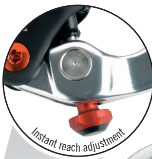
Instant reach adjustment

New for 2011: upgrade your brakes with our new FCS (feeling control system) and instant reach adjustment. Parts only available from a Formula dealer.